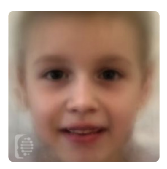
Figure 2. Composite figure analysis of the facial phenotype of individuals with KMT2E -related neurodevelopmental disorder in Figure 1, excluding Individual 30, who is wearing glasses

Reprinted with permission from O'Donnell-Luria et al [2019]