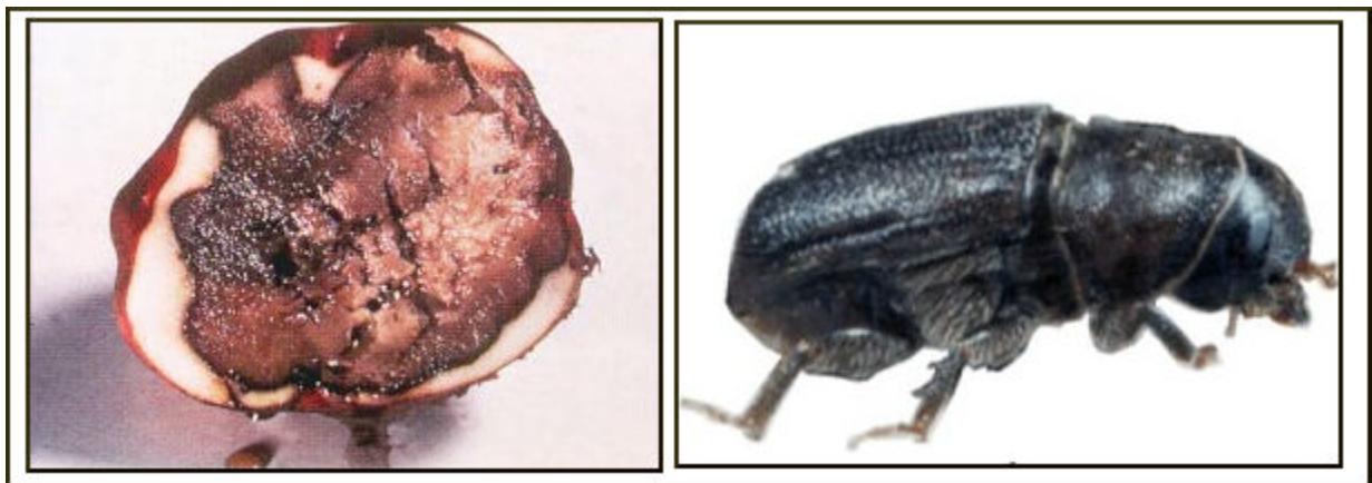
Root rot caused by Pythium (left); the mountain pine beetle (right).

The mountain pine beetle ( build information , 6,783 clusters , FTP ) is a bark beetle that is a destructive pest of pine forests in the western United States. Analysis of this beetle's transcriptome should provide important insights into pheromone biosynthesis and potentially specific control mechanisms for these pests.