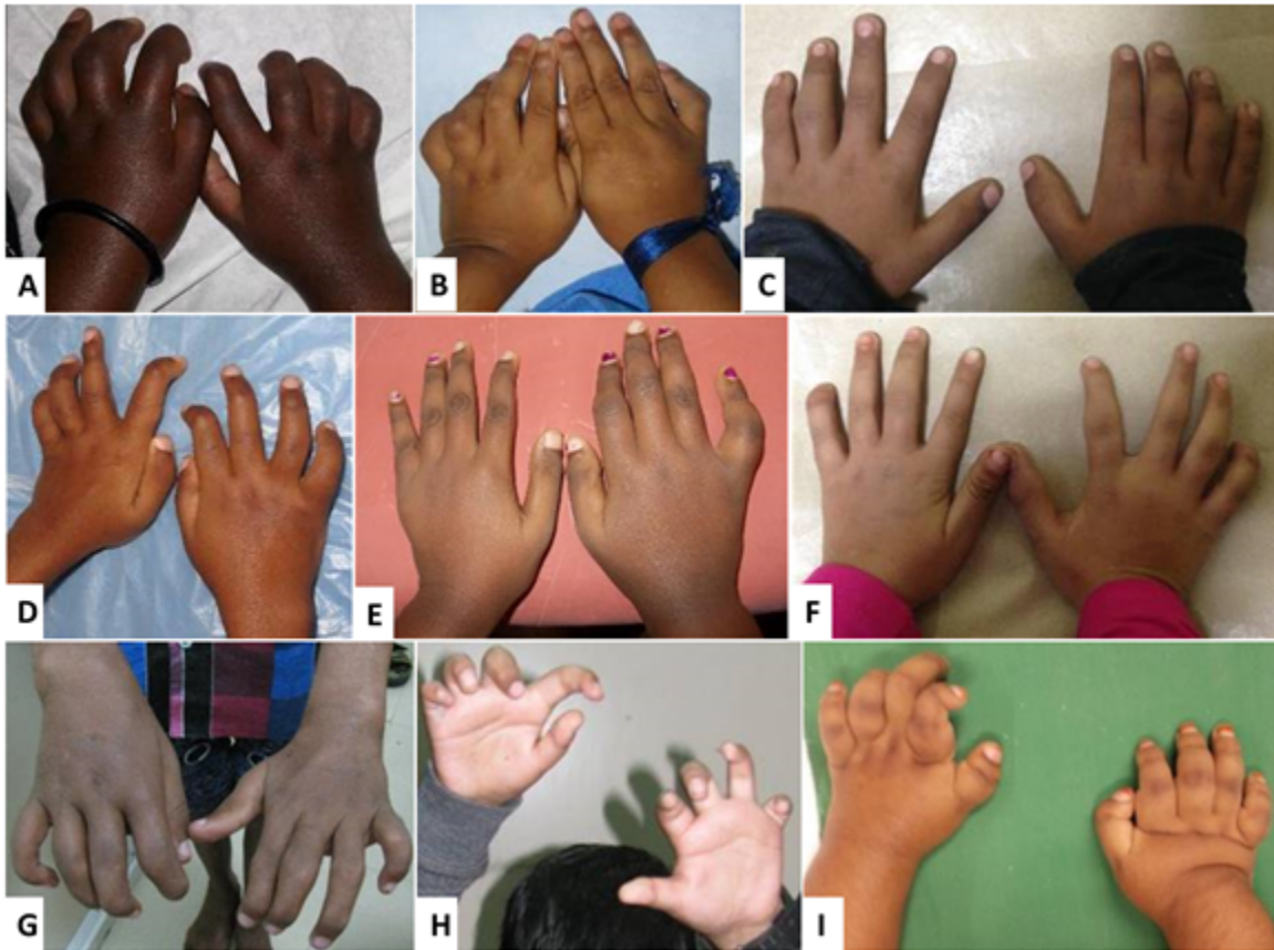
Figure 1. Hands of different children with MONA showing joint contractures and swelling of the digits at age 4 years (A), 5 years (B), 7 years (C,D), 9 years (E), 10 years (F), 13 years (G,H), and 15 years (I).

From Bhavani et al [2016]; republished with permission of John Wiley and Sons