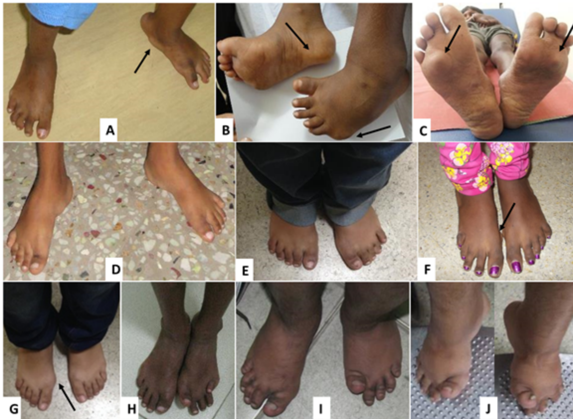
Figure 2. Feet of different individuals with MONA at ages 5 years (A), 6 years (B,C), 7 years (D,E), 9 years (F), 10 years (G), 13 years (H,I), and 15 years (J). Subcutaneous nodules are seen in A, B, C, F, G (arrows).