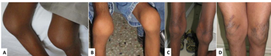
Figure 3. Swollen knee joints in children with MONA at age 6 years (A), 7 years (B), and 13 years (C,D). Note serpiginous hyperpigmented skin lesions in C and D.