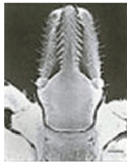
The mouthparts of a deer tick, as viewed down an electron microscope. The tick is responsible for transmitting the bacterium that causes Lyme disease.

In the mid-1970s, a number of residents of the small town of Lyme in Connecticut were afflicted with an unusual arthritis-like condition. Most new cases were observed in the summer and early fall of each year, and the incidence was soon linked to recent tick bites in a high percentage of patients.