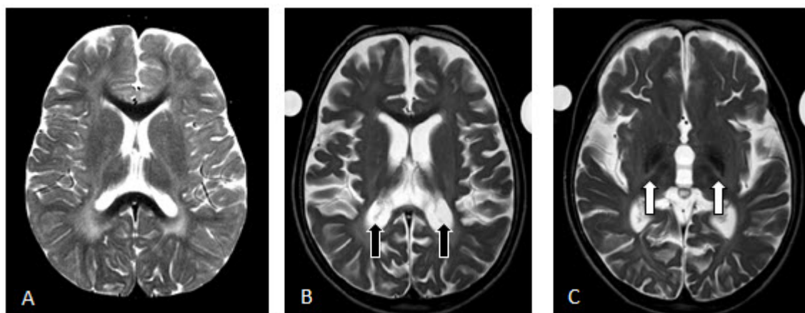
Figure 3. Brain MRI findings in a child with the late-infantile form of GM1 gangliosidosis

A. At age 3 years 6 months: T 2 -weighted axial view showing minimal atrophy