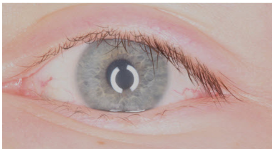
Figure 1. Image obtained with a slit lamp demonstrating mild-to-moderate corneal clouding in an adolescent with the juvenile form of GM1 gangliosidosis