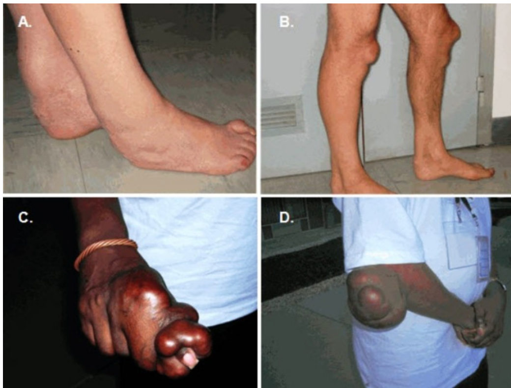
Figure 1. Different localization and severity of tendon xanthomas in CTX. Besides the classic xanthomas of the Achilles tendon (A), xanthomas of the patellar tendon (B), the extensor tendons of the hand (C), and the extensor tendons of the elbow (D) have been observed.