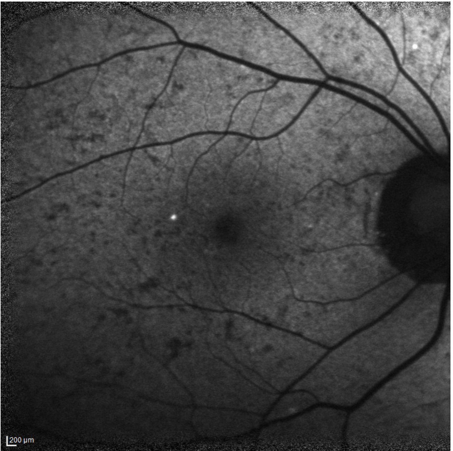
Figure 4. Fundus autofluorescence image from the right eye of a female carrier age 30 years