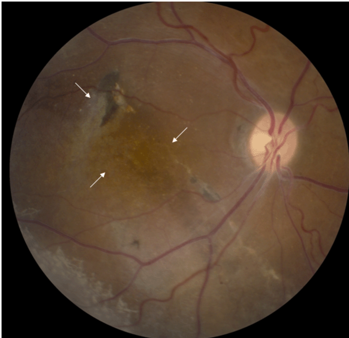
Figure 3. Fundus photo of a male with congenital retinoschisis showing atypical, more severe findings with arrows pointing to atrophic macular changes