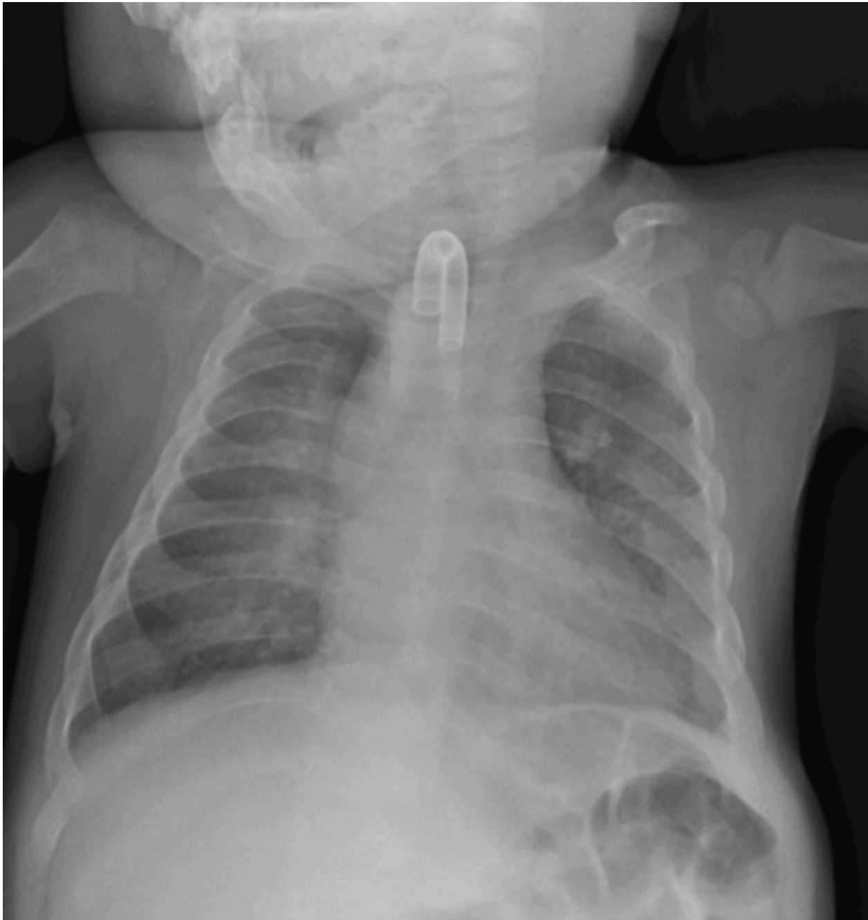
Figure 3. Radiograph of treated hypophosphatasia. Individual from Figure 2A after 12 months of asfotase alfa enzyme replacement therapy. Note tracheostomy tube, placed for laryngomalacia and bronchomalacia, features of the treated disease. Rachitic rib and metaphyseal changes have resolved. The two epiphyseal growth centers at the proximal humeri are normal.