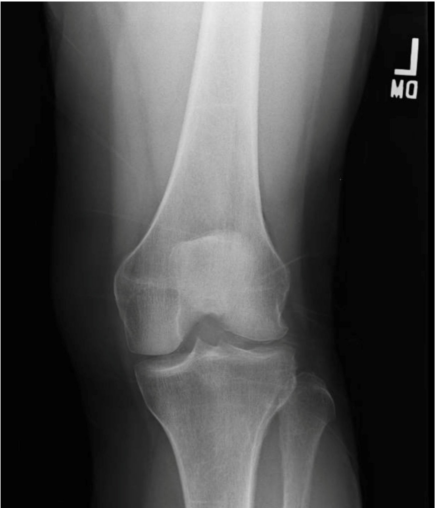
Figure 4. Radiograph of treated adult hypophosphatasia: linear sclerosis in remodeling distal femur and proximal tibia, osteophytes mid-proximal tibia, and chondrocalcinosis medial lateral compartment