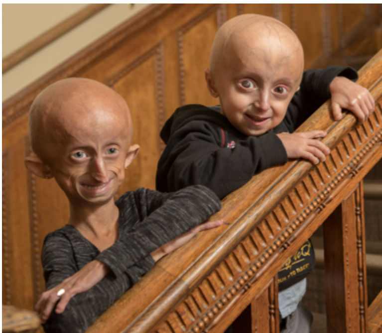
Figure 1. Female age 11 years and male age six years with HGPS displaying classic features